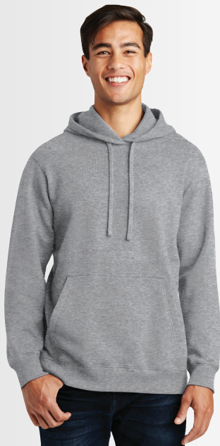
PC850H Athletic Heather