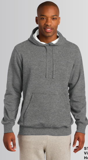
ST254 Vintage Heather