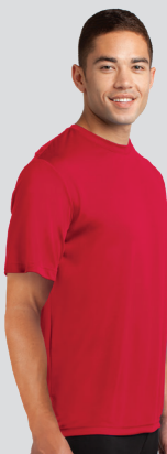
ST350 True Red