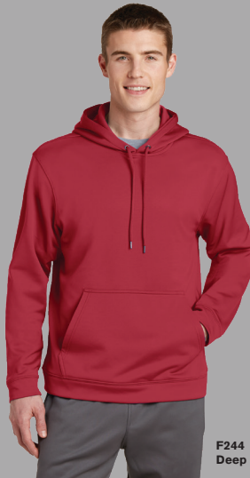
F244 Deep Red