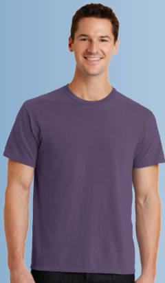
PC099 Vintage Plum