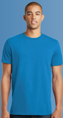
DT5000 Neon Blue