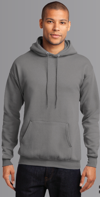
PC78H Medium Grey