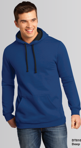
DT810 Deep Royal