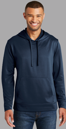
PC590H Deep Navy