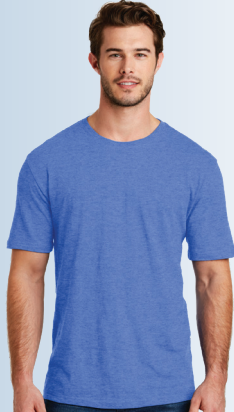
DM108 Heathered Royal