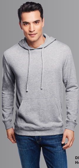
DM391 Heather Grey